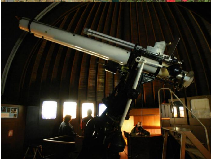
Photos: Gerjo van Rhijm http://www.prague-information.eu/prague_monuments/petrin_hill_and_observation_tower/stefanik_observatory http://commons.wikimedia.org/wiki/File:%C5%A0tef%C3%A1nik_Observatory_Zeiss_Refractor.jpg